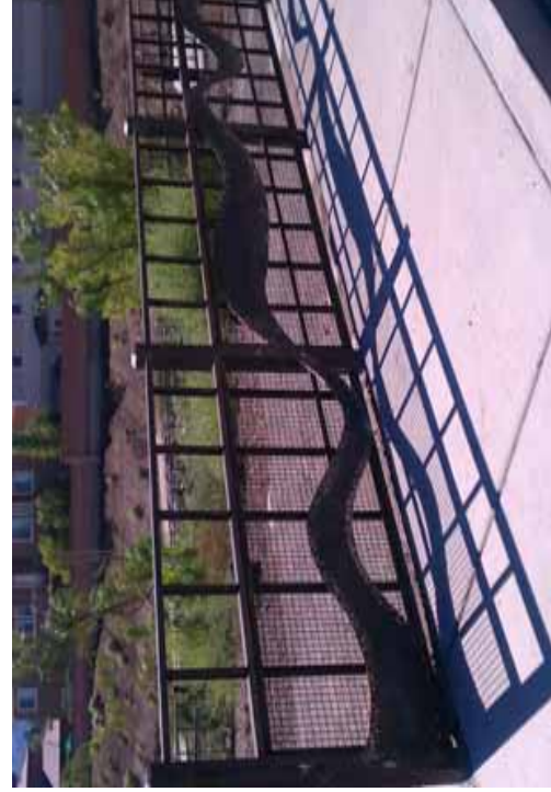
ENTRY WITH INTERPRETIVE ELEMENTS