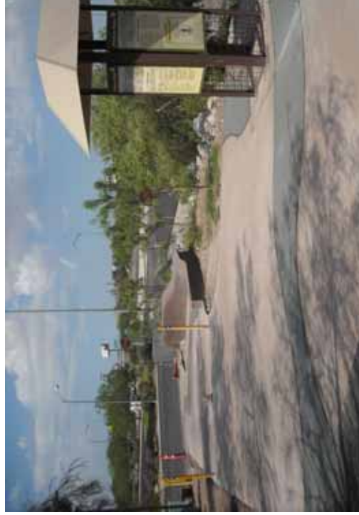
ENTRY WITH INTERPRETIVE ELEMENTS