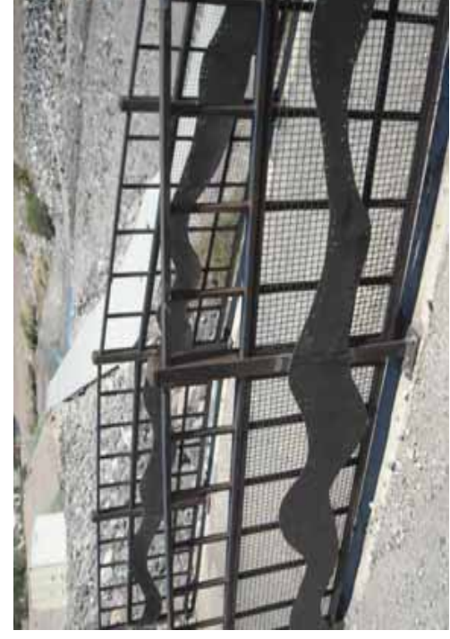
RAMP WITH INTERPRETIVE ELEMENTS