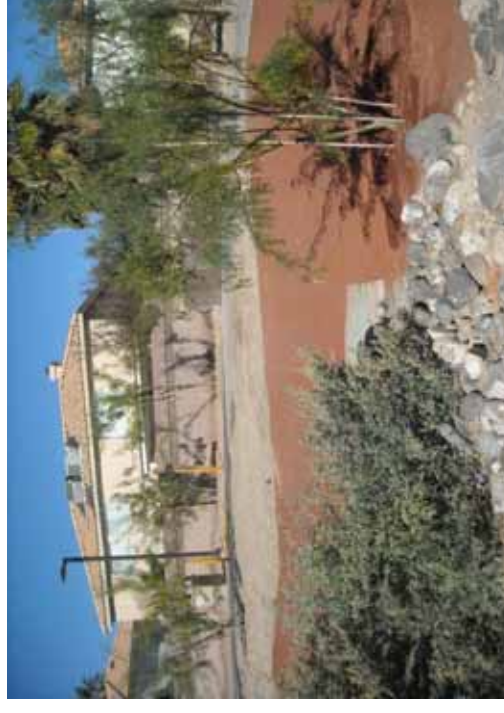
DESERT ADAPTIVE LANDSCAPE