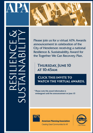
National APA Resilience and Sustainability Award